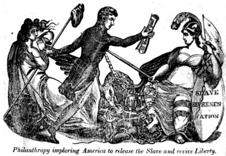
Philanthropy imploring America to release the Slave and revive Liberty.

And, since America was founded on HUMAN RIGHTS, no American student can ignore the role that country plays in defending them or letting them die. Find links and materials at amnestylewes.org !